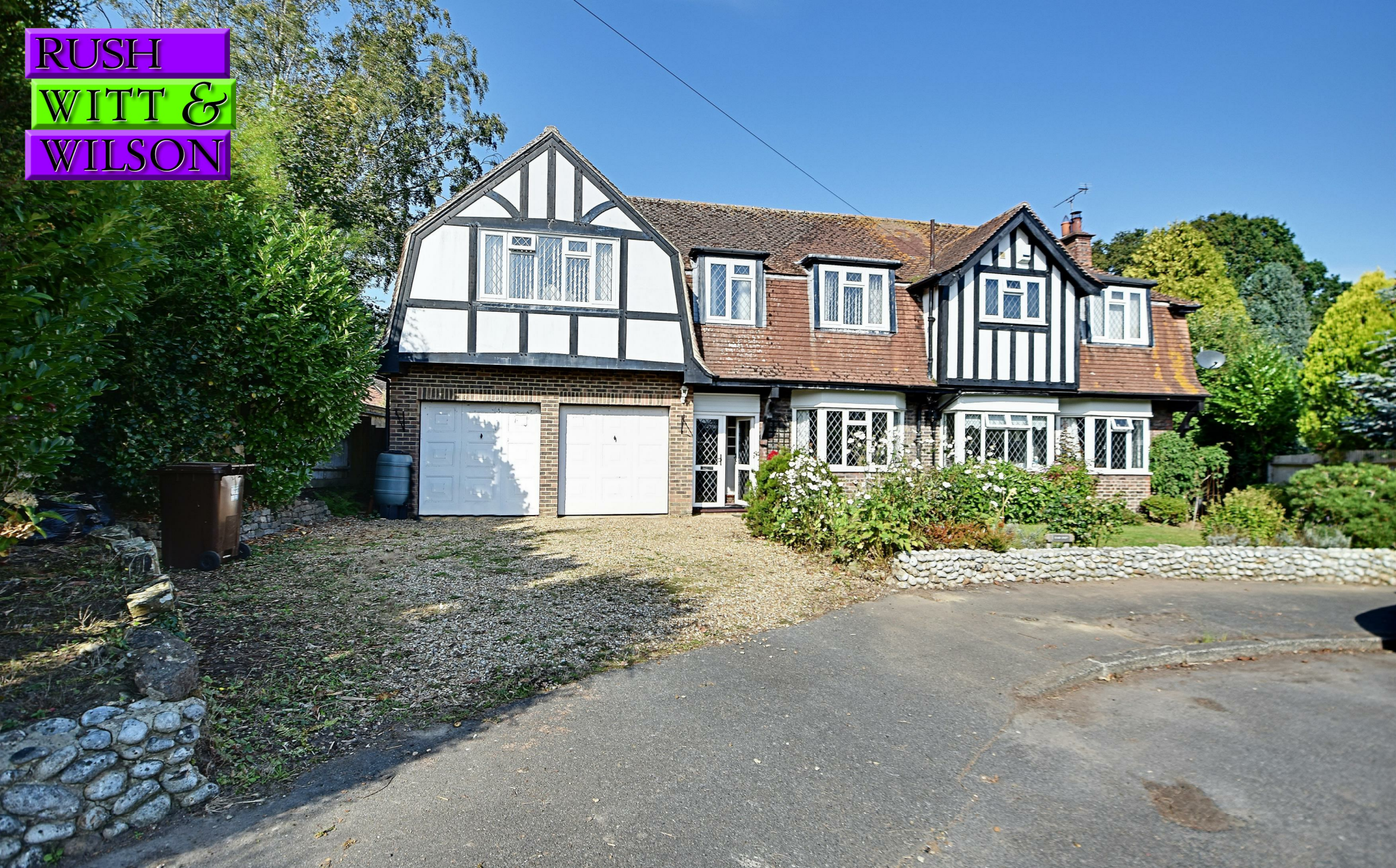
Deancroft Howards Crescent, Bexhill-On-Sea, East Sussex TN39 4QH £750,000